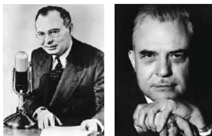
Dave Elman & Milton Erickson

There is currently no consensus as to the definition of hypnosis. For Elman, it was a state of mind that allowed for the bypassing of the critical factor of consciousness and the establishment of selective thinking (9) . For Erickson, it was a special state of consciousness characterized by receptivity to ideas (10) .