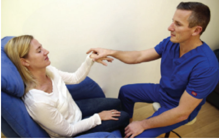
Formal Hypnosis Induction

We use formal hypnosis in two specific areas – operative and therapeutic hypnosis.