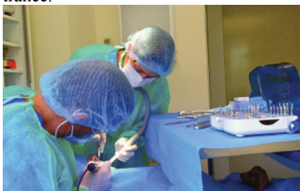
Hypno-anesthesia in implantology

They are only carried out on patients with significant motivation as the absence of classic anesthesia can severely inhibit the ability to go into a trance.