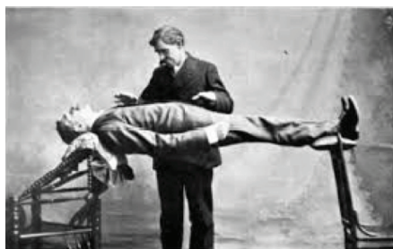
Catalepsy between two chairs as part of a stage hypnosis act

What we think about it is often colored by popular imagery, the media, hearsay and so on, providing plenty of fuel for the imagination, as well as for excessive, even irrational behavior.