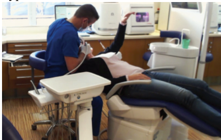
Operative hypnosis (hand raising)

The type of operative hypnosis carried out in the surgery is Elmanian hypnosis (17) .