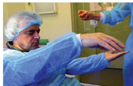
Deep somnambulistic trance induction

Finally, at the end of the session, the subject is brought back to an ordinary state of consciousness, returning to the here and now using an emergence technique (direct or indirect). They should feel in great shape, completely re-associated and in their normal state of consciousness.